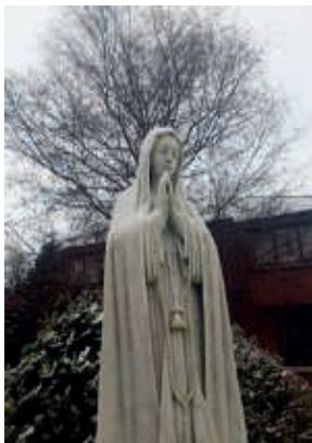
Our Lady of the Rosary, All Saints' Church, Ballymena

The great Saint Peter Claver was another of God's heroes who used the Scapular to good advantage. Every month a shipment of one thousand slaves would arrive at Cartagena, Colombia, South America. Saint Peter used to ensure the salvation of his converts. First, he organised